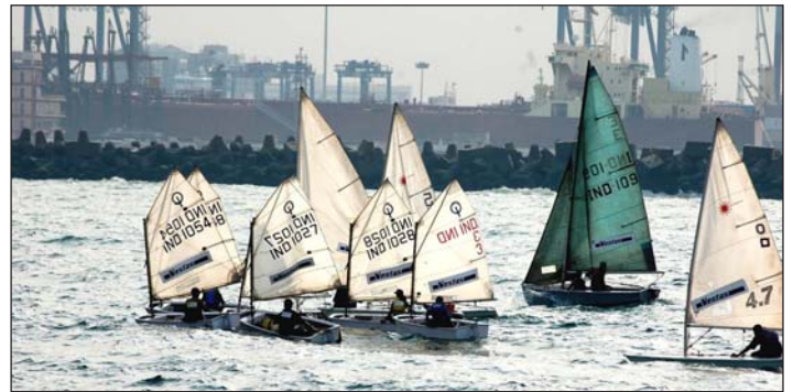
The boats sailing in between marks

social commitment I would like to point out that fisherfolk children from tsunami affected coastal habitations have been adopted and one of them has won the Championships in the Beginner’s event in Pune, Maharashtra.