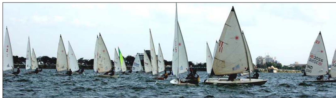
Hussain Sagar Sailing Action

The Inland Laser National Sailing Championships 2007 are going to be held in the Hussain Sagar Lake Hyderabad from 4 th to 12 th of August. Six 4.7 and one Radial sailor from TNSA will be participating. There is the slightest bit of butterflies in the stomach remembering the fury of the winds spiced with even more furious