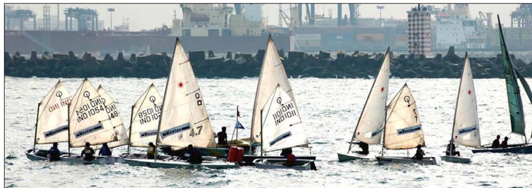
At the mark rounding on the water