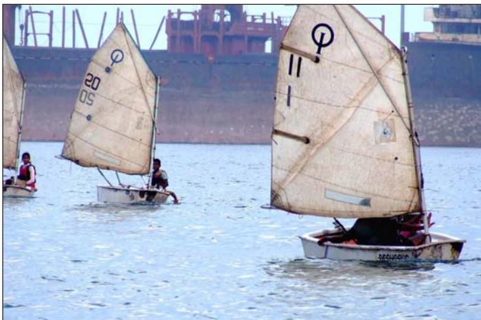
Summer Sailing Campers are back

The new comers were soon put through the hoops, their strengths tested and directions given as to what they were to do rest of the week to improve their fitness. The coal dust environment and the true sailor's obliviousness to it was incomprehensible to some of the new parents, but they soon saw the vibrancy and joy that it was imbued with. The first month it is still difficult to say how many will continue as the attendance is a little erratic and bonds are yet to form. But it is quite evident that many of the children are