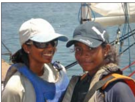
The Double A team

But by the end of the first day, they had gelled as a team and figured out the boat, both laser sailors otherwise.