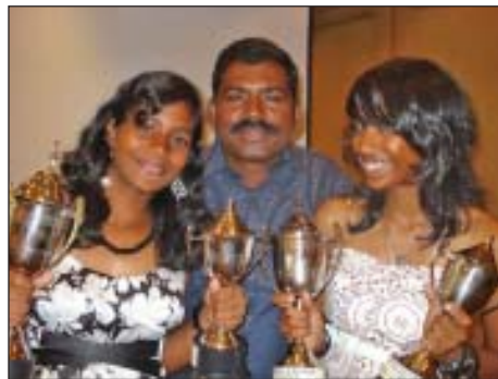
A proud dad with the winners

that at times touched 18 knots. The green team finished a very creditable 8th overall out of 18 entries, 2nd among the 4 "women" entries just 3 places behind the much-experienced team of Rohini Rau and Pallavi who finished 5th overall and 1st among the Girls (youth), ahead of the NSS Girls Team. Out of the 4 Youth entries, they finished 2nd overall with Aman Vyasa and Sarad Singa from NSS taking the first among the Youth. If that was a stellar performance, what followed was even more noteworthy.