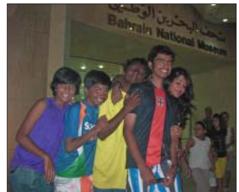
The Rogues Gallery!

The races scheduled for the 26 th and 27 th were abandoned as winds died down completely. This wasn't new to our sailors as last year also 2 days' races were abandoned. However it was a definite improvement on last year as only 6 races were sailed last year while 9 races were sailed in the Optimist and 10 in the laser out of the scheduled 13 this year. Makes one reflect how fortunate TNSA has been that the conditions have favoured us so well that we have held the full complement of races in every one of the Nationals we have held in the last 5 years.